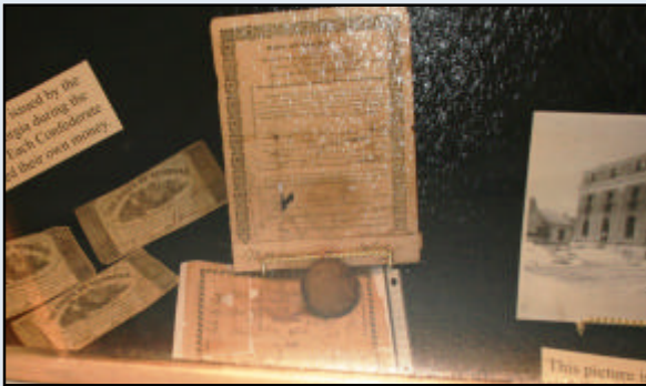
The display shown above is located on the first floor of City Hall and provided by the Lowndes County Museum.

A new display case in City Hall features a letter by Valdosta's first mayor, Reuben T. Roberds, written on Feb. 25, 1864, in Fredericksburg, Va., to his wife describing the wounds he received at the Battle of Knoxville. The display also features paper money issued by the State of Georgia during the Civil War.