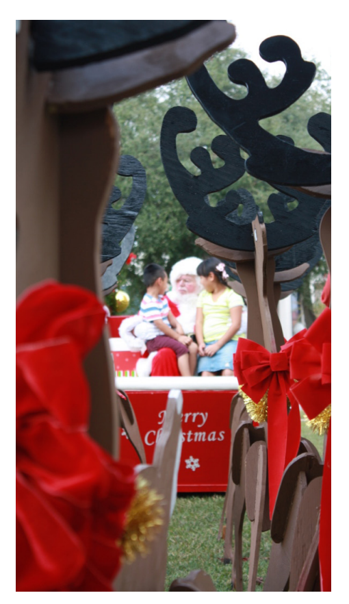
Greater Valdosta Community Christmas Parade

The Greater Valdosta Community Christmas Parade—one of Valdosta's most popular holiday traditions—will begin at 5 p.m. following the Holiday Open House event.