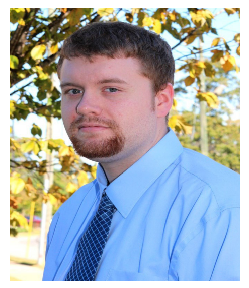
A New Look on Metro 17

The VFD participated in the Stocked Cart Race, sponsored by the Valdosta-Lowndes Parks and Recreation Authority, on Nov. 15. Participating teams decorated shopping carts filled with donated food, then raced eachother. All proceeds benefited "Hungry at Home." The VFD entered two carts in the race, one of which won the award for best decorated cart (third cart above). Kudos to the graduates of the 2015 Citizens Fire Academy, who also entered a cart for the event (middle cart in photo above).