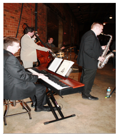
VSU Faculty Jazz Ensemble performs for Bird Supper guests.

For over five decades, the Lowndes County Bird Supper has been bringing together hundreds of state officials and local business, professional and government personnel for a dinner of quail and important conversation. The 2015 Bird Supper is scheduled for Wed., Jan 28, at the Georgia Railroad Depot, in Atlanta, at 5 p.m.