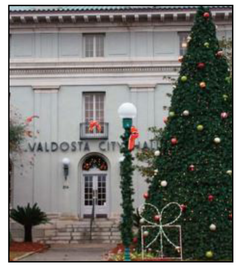
The annual Christmas Tree Lighting lights up the City of Valdosta.

The Valdosta Youth Council will be accepting donations for the Mayor's Motorcade and hosting a table on which attendees can sign greeting cards for military service members deployed during the holidays. The greeting cards will be mailed through the American Red Cross Holiday Mail for Heroes Program.