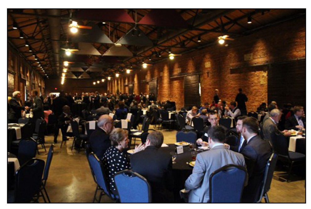
The 2017 Bird Supper allowed local business, professional and government personnel to meet with state officials for a dinner of quail and important conversations.

Tickets may be purchased for $50 each on the first floor of the Lowndes County Judicial Building or at Valdosta City Hall. Don't miss this opportunity to meet on an informal basis with top state leadership and to have a voice on issues