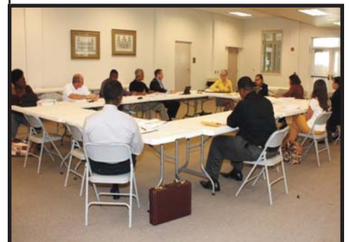
The next scheduled meeting of the Fair Housing Committee is Nov. 8.

For more information or to obtain a meeting agenda, contact the city’s Neighborhood Development Department at (229) 671-3617.