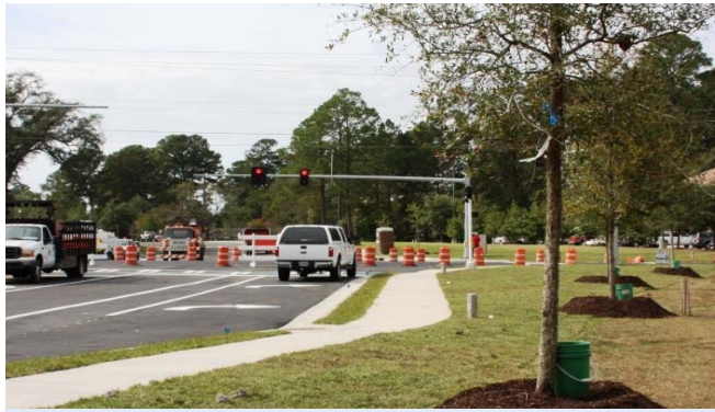
Gornto Road Extension near ready for Oct. 18 Ribbon Cutting event and traveling public's use on Tuesday, Oct. 22.

The new road, which was funded by SPLOST VI revenue, will ease traffic congestion on Northside Drive and Jerry Jones Road and will provide citizens with a primary, major east/west route to and from the large commercial area near the Valdosta Mall. The city also expects