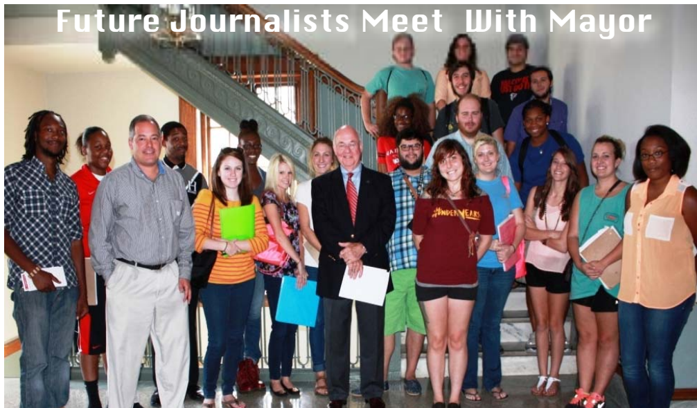
Future Journalists Meet With Mayor

Remember to base your SPLOST decision according to the facts, and please vote responsibly on Nov. 5. For more information about City of Valdosta SPLOST projects, visit www.valdostacity.com .