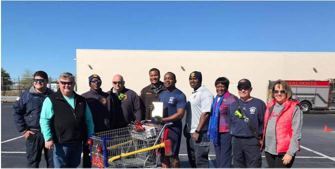
Valdosta Fire Department took First Place in the Hungry at Home Cart Race.