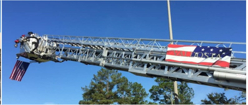
It is always an honor for Valdosta Fire Department personnel to be invited to events honoring our veterans.