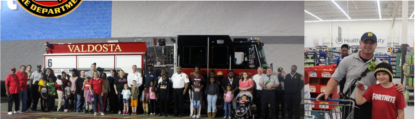
Valdosta Fire Department members and the Citizens Fire Academy Alumni provided 10 Families (26 children) with gifts this year through the Shop with a Firefighter Program.