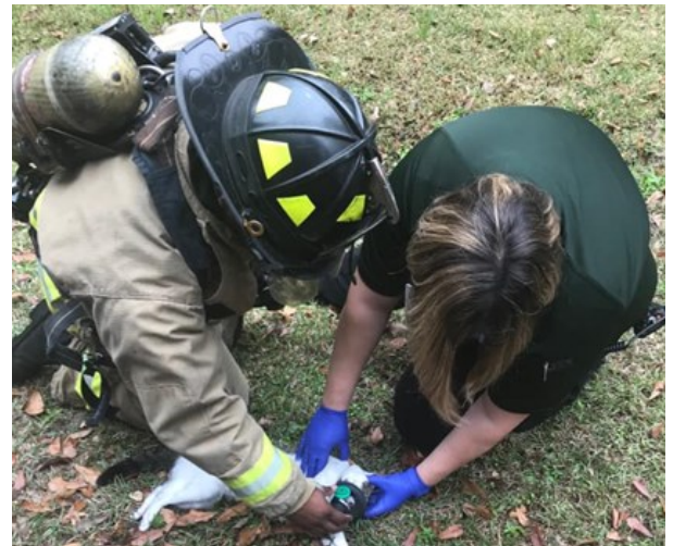
Valdosta Fire Personnel along with SGMC medics were able to rescue and resuscitate a kitten after fire personnel removed it from a house fire.