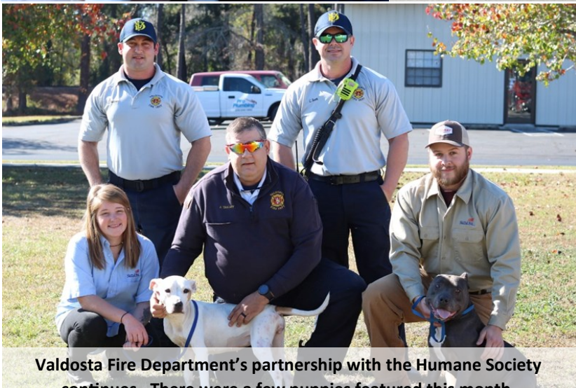
Valdosta Fire Department's partnership with the Humane Society continues. There were a few puppies featured this month.