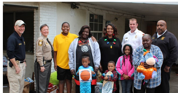
Valdosta Fire Department and Valdosta Police Department partnered up in providing Christmas to a family that lost their presents in an apartment fire.