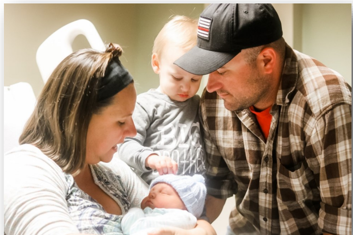
Welcome to the family!