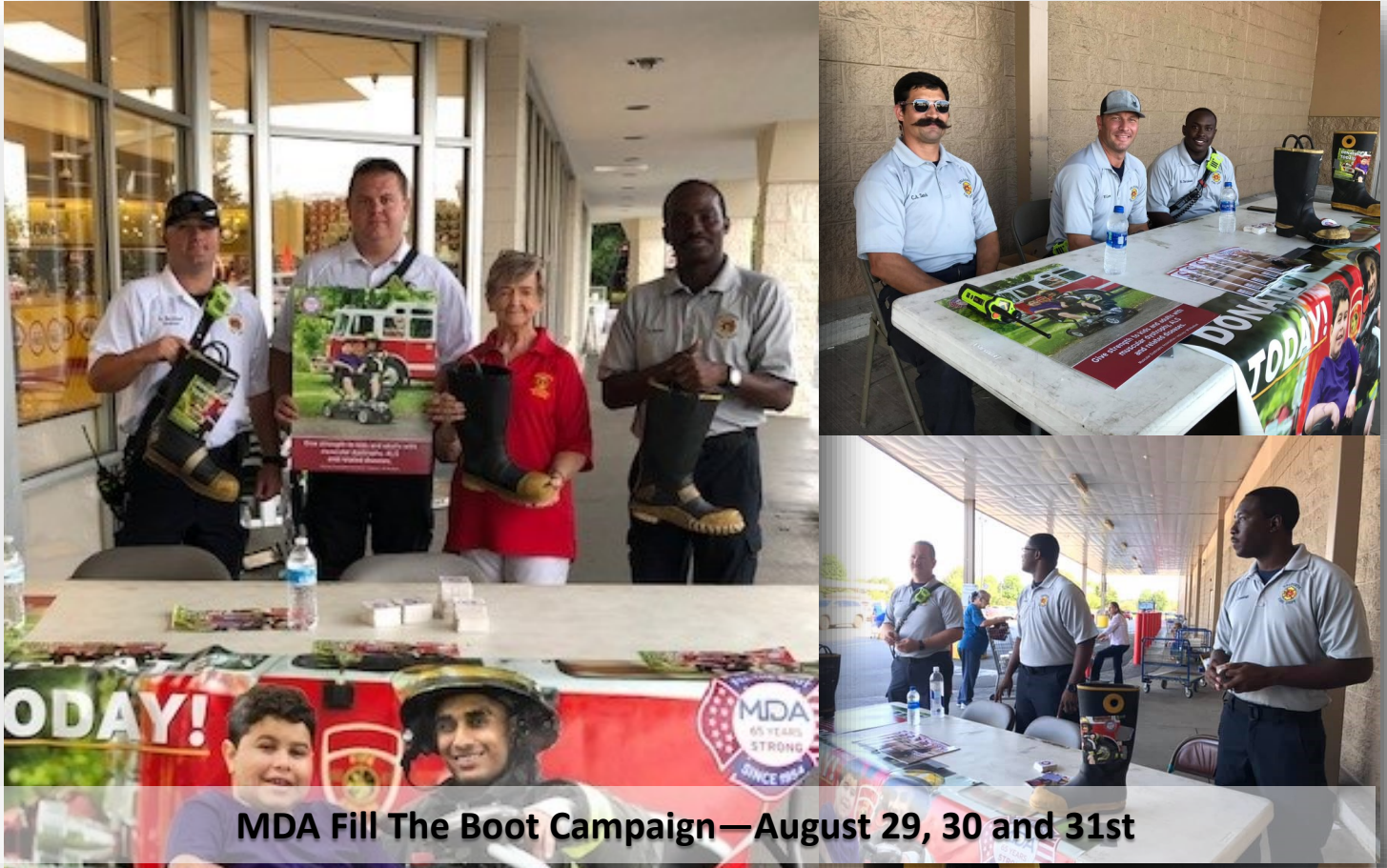
MDA Fill The Boot Campaign—August 29, 30 and 31st