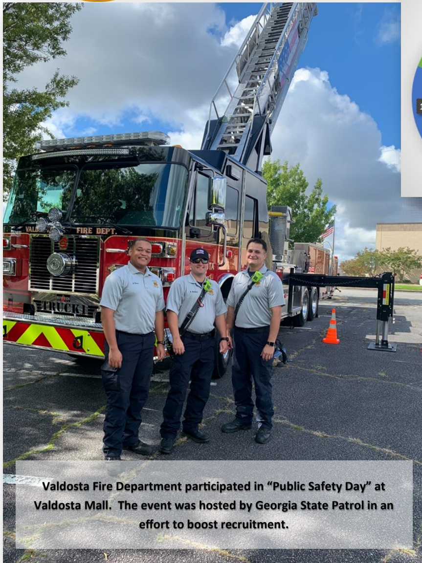
Valdosta Fire Department participated in "Public Safety Day" at Valdosta Mall. The event was hosted by Georgia State Patrol in an effort to boost recruitment.