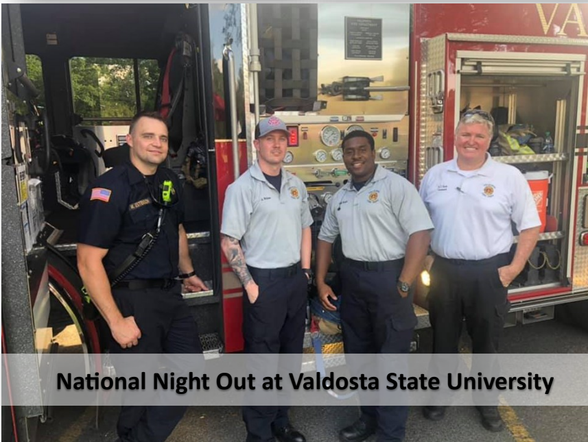
National Night Out at Valdosta State University