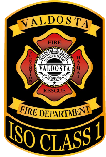
Fire Chief, City of Valdosta